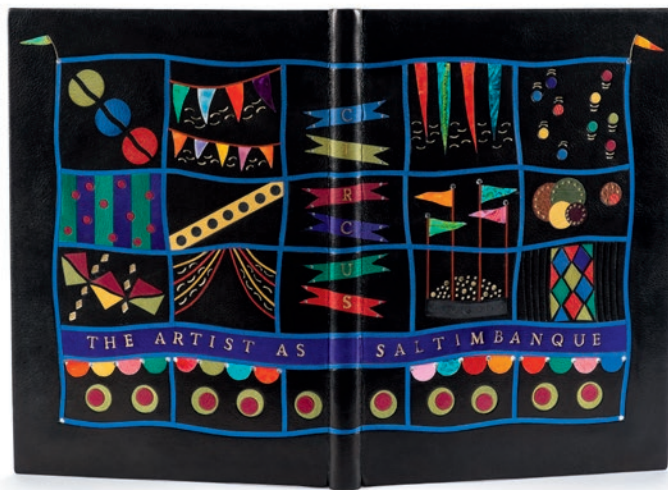
CIRCUS: The Artist as Saltimbanque bound by Lester Capon published by Shanty Bay Press, 2011